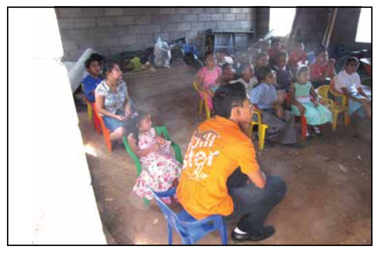
The Sanctuario children celebrate their first Sabbath in their new Sabbath School room.

departure date in mid-December, enough donations had arrived for not only the completion of the church, but the addition of another three-fifths of a building for a children's Sabbath School classroom!