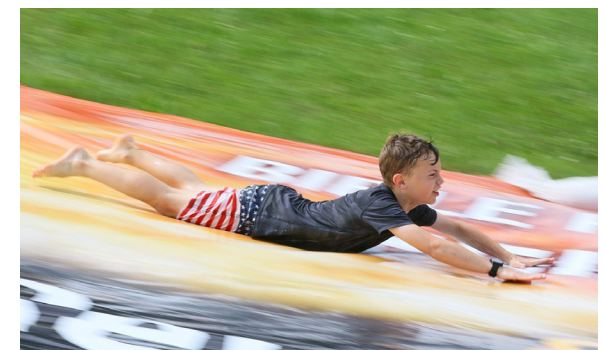
Cooling off and having fun with the slip and slide.