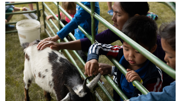
The Kindergarten 1 division joined several other divisions for a petting zoo!