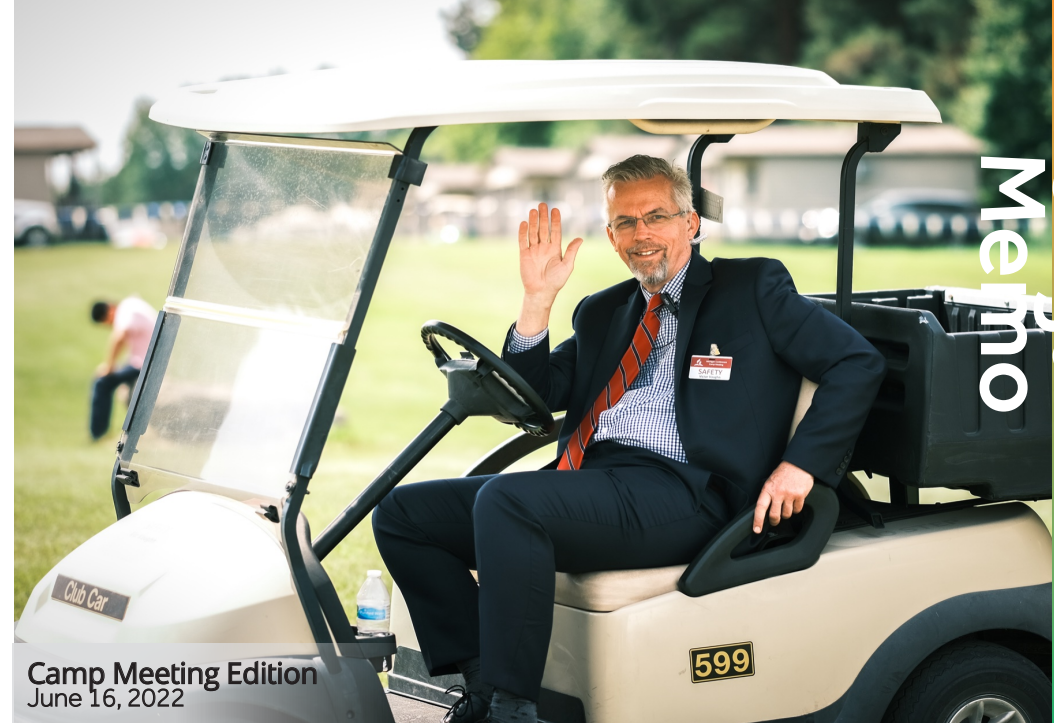
Camp Meeting Edition June 16, 2022