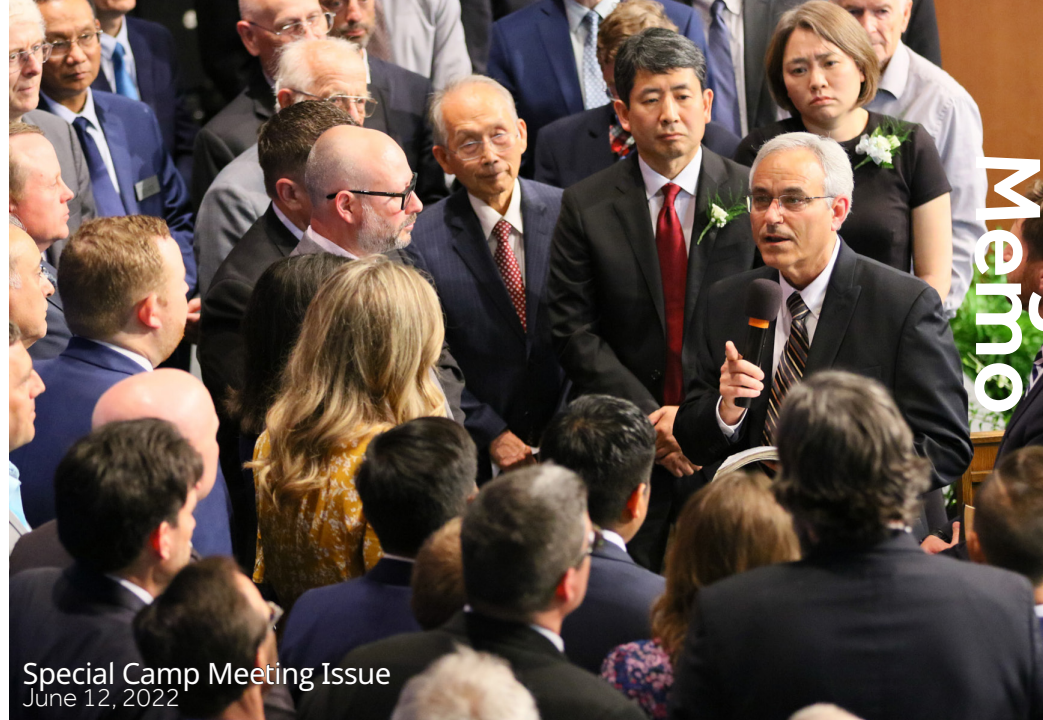
Special Camp Meeting Issue June 12, 2022

(Produced by the Michigan Conference Communication Dept.)