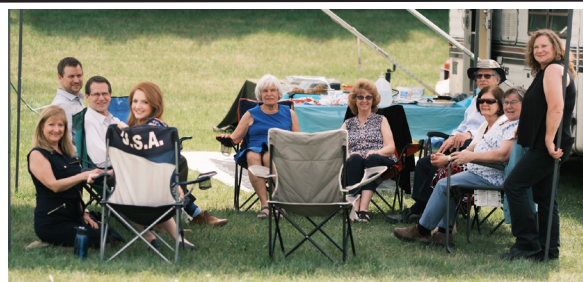
A cherished pastime is spent with friends during lunchtime!