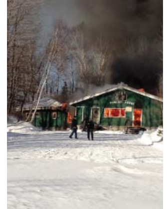
Pomeroy Lodge fire February 17, 2013

After assessing the insurance funds, the Sagola board, with representation from all the U.P. churches, decided to step out in faith. The old building was