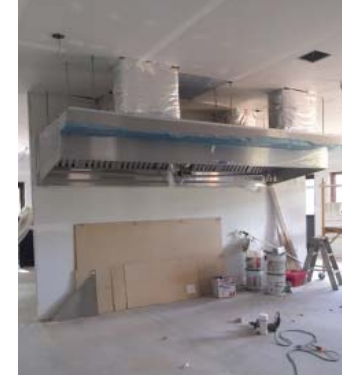
Range hood in the new kitchen area.

company. They are close to reaching their goals, but need an additional $50,000 due to some unforeseen circumstances. I believe their building committee has worked hard to stay within their financial means. The building is beautiful and well built for the tough winters of the U.P. Currently, they are praying and working to raise the rest of the funds to complete phase one.