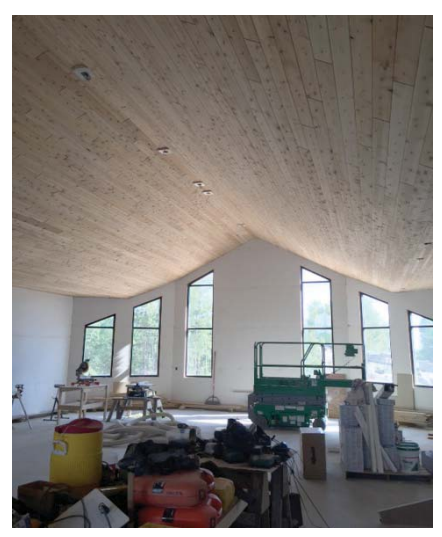
Vaulted ceiling in the dining and meeting room.

The new lodge will provide all kinds of ministry opportunities for the churches in the U.P. The youth, especially, are blessed by the summer camps and Pathfinder activities. In addition, many departments of the Michigan Conference canvassing programs, personal ministries, family life, health, spring/fall retreats, and U.P. camp meeting, to name a fewwill have their needs met through the completion of