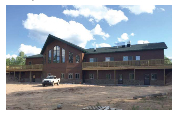
View of the back of the lodge and the walkout basement level.

the new lodge! I believe the Lord will impress hearts to raise the funds for this important need!