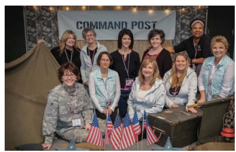
Women's Ministries Leadership Team

In conclusion, the Michigan Women's Retreat attempts to focus on various components of the Grow Michigan initiative. This year's event—Faith Not Fear—was a great success because people were brought closer to Jesus.