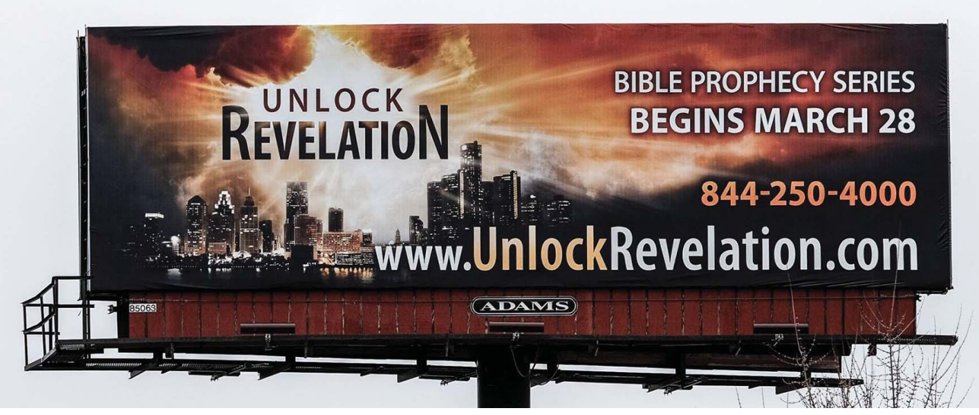
Note: We're receiving many amazing stories regarding Unlock Revelation. We can't share them all, but here's a couple to get us started. Look for more stories and pictures in the upcoming Memo and on our Facebook page at https://www.facebook.com/miconf.

"No sooner is one converted than there is born within him a desire to make known to others what a precious friend he has found in Jesus. The saving and sanctifying truth cannot be shut up in his heart." (Desire of Ages, p. 141)